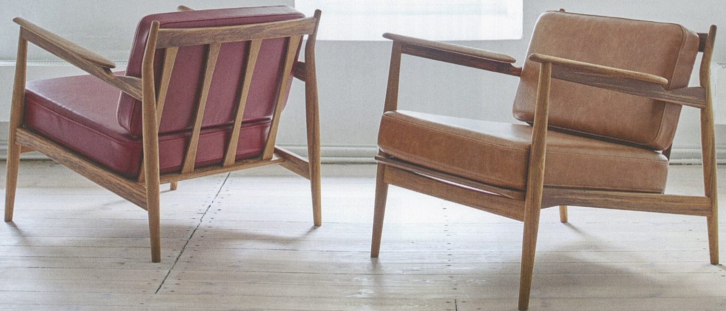
Image: Model 107 shown in oiled teak wood with Dunes and Savanne leather

MODEL 107 REBORN IN 2019 SIMPLY BEAUTIFUL!