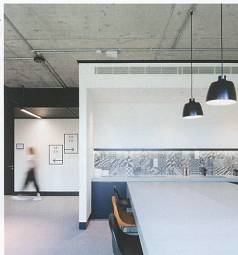
ABOVE: Breakout space and tea points are provided on each of the working floors.

“ We wanted to create a building that was very much 'of the area' and for people in this area ”