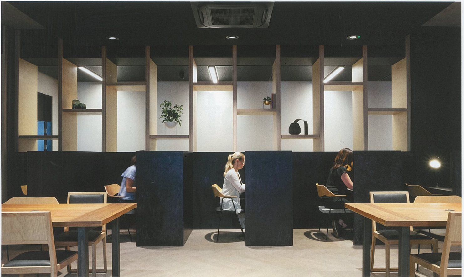
THIS PAGE: Private desk booths provide dedicated work zones within the open plan ground floor workspace.

the desk booths marries black stained ply with cork lining, and provides focused personal work zones.